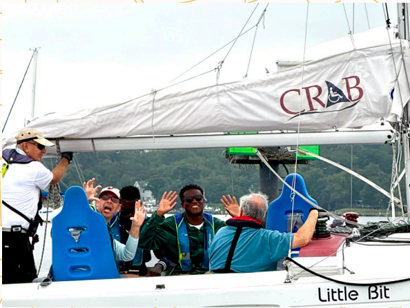
CRAB Sailing in Annapolis