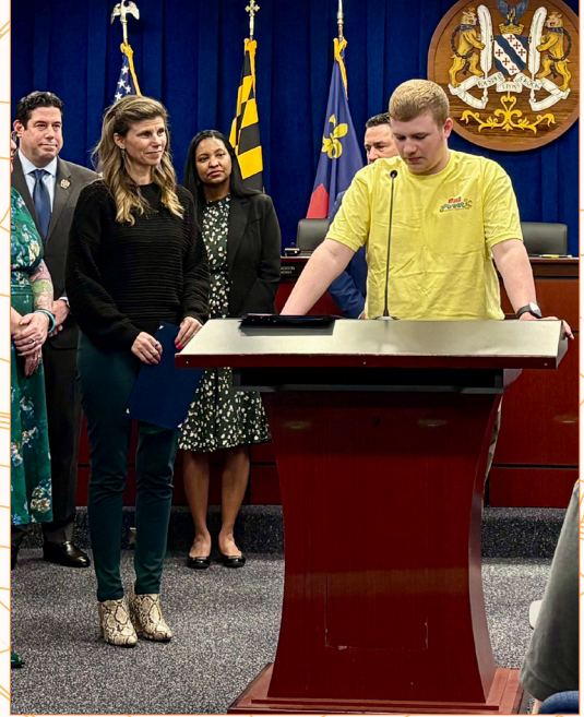
Acceptance of Proclamation, City of Rockville